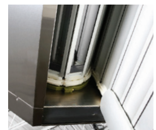
No Metal-to-Metal Contact