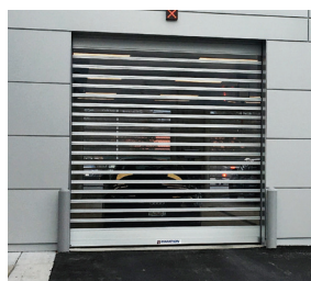
Full Width "All-Vision" Slats